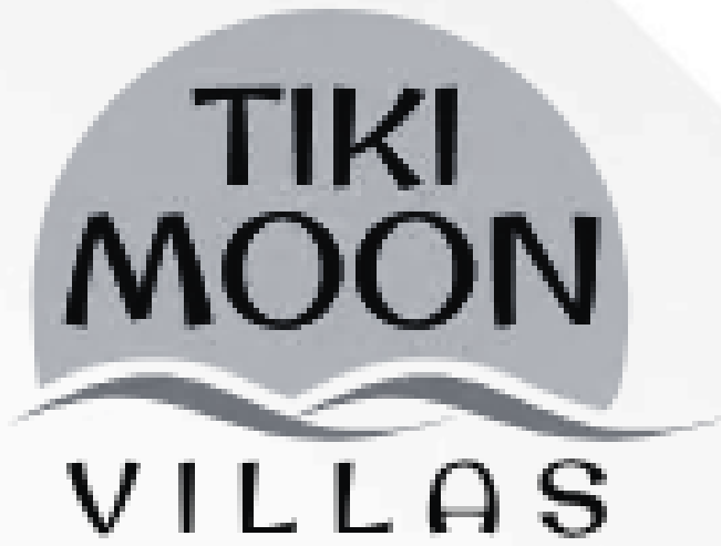
Tiki Moon Villas