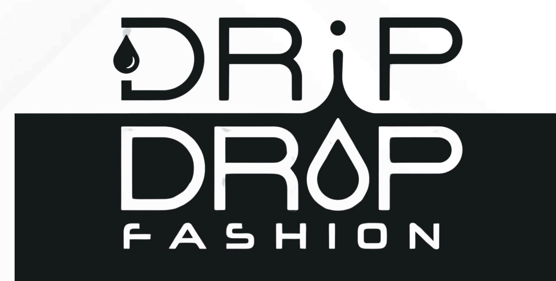
Drip Drop Fashion