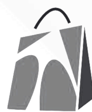
NOTUN SHOP HOME, FASHION & LIFESTYLE