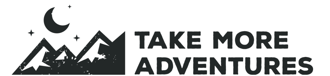
Take More Adventures